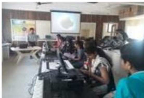
Students while making Various robots based on Arduino during the Workshop HAWAI-19