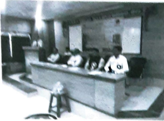
Inauguration Session of HAWAI -19