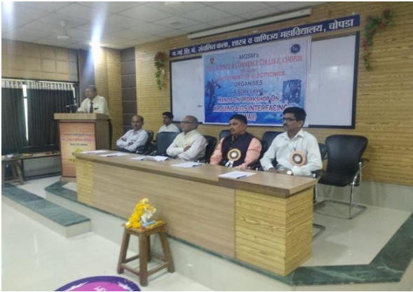
Inauguration Session of HAWAI -19