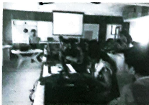
Students while making Various robots based on Arduino during the Workshop HAWAI-19